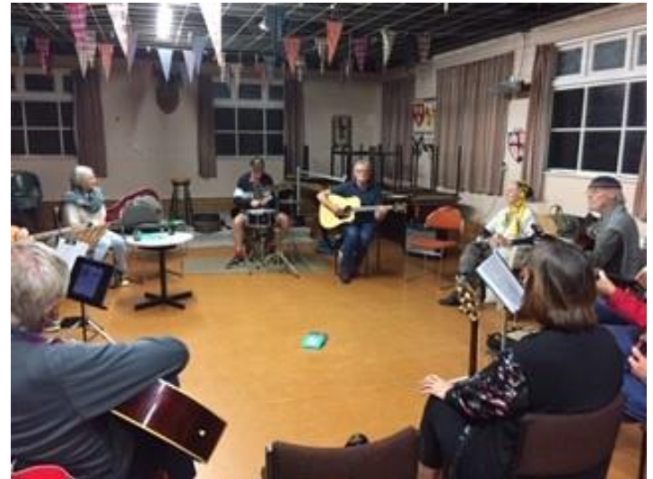
Photo of our last Club Night to give those of you who have not come along an idea of what we do. Basically we go round the circle and you get to perform if you want to. You can play by yourself or invite others to join in. We normally get round the circle a couple of times before supper and once after. It is a chance for us all to share and enjoy others performances. It is a totally supportive and no pressure environment so please feel free to come along, 4 th Friday of the month.